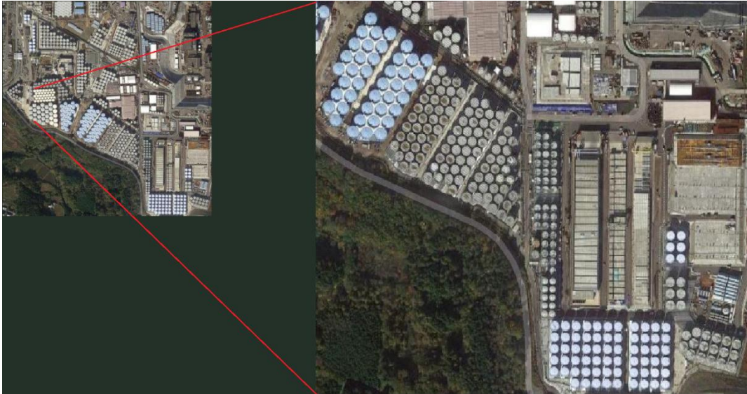
Figure 5. View of the radioactive water storage tanks

Within the criteria and knowledge of the students, a proposal was made for a system to process contaminated water, which was implemented in Japan to cope with such an environmental contingency. The last major leak occurred on February 19, 2014, when about 100 tons of radioactive water leaked from one of the tanks (Figure 5). The leak was discovered six hours after starting, so it seems that the water could be prevented from reaching the sea (Castejón, 2017).