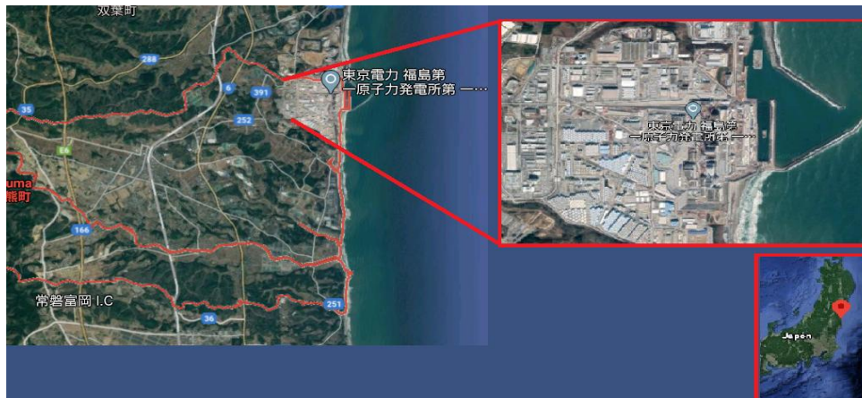
Figure. 1. Geographic location Fukushima nuclear power plant, Japan

Fukushima Daiichi was built in 1971, this nuclear power plant is one of the 25 largest in the world. Its six reactors are numerically denominated from 1 to 6 (Morones, 2012). The Fukushima Daiichi nuclear power plant is located in the city of Okuma, in the Fukushima district in north central Japan on the eastern side of the island (Azorín, 2011), as seen in Figure 1.