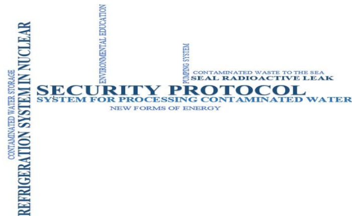
Figure 3. Code cloud